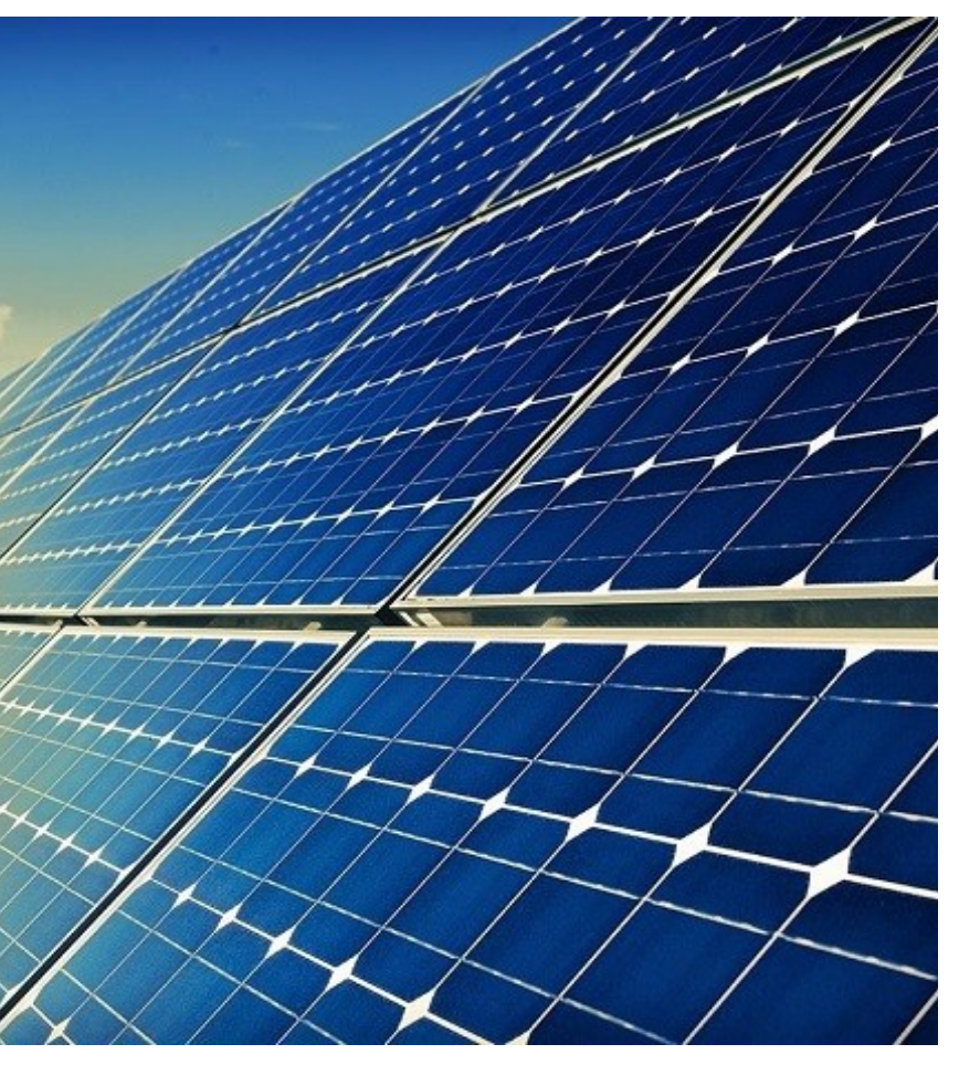
Solar power plant to inject electricity on the grid