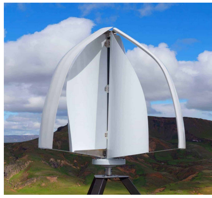
Low visual impact wind generation based on vertical blade systems